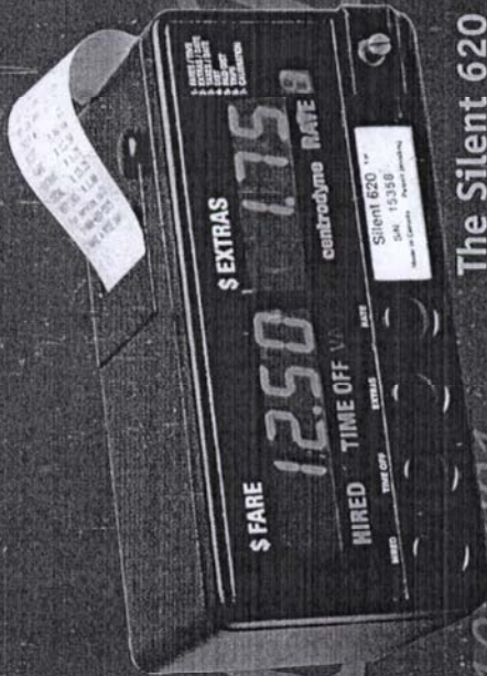
The Silent 620 Printing Taximeter