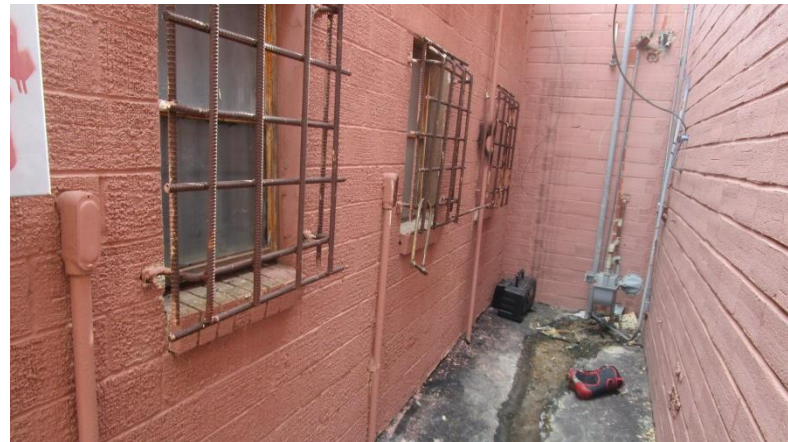
❑ After graffiti removal