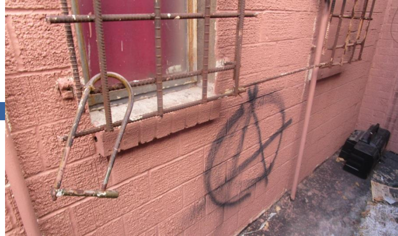
❑ Before graffiti removal