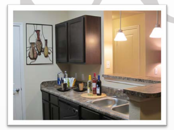
Unit - Kitchen