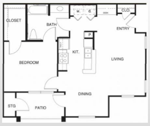
1 Bed Floor Plan (800 SF)