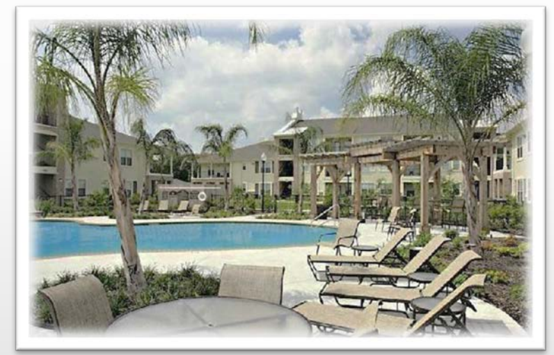
Pool Area - Stone Bridge of Abbeville