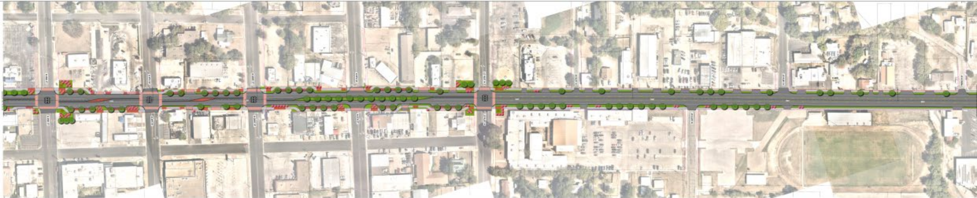
SECTION C-C - VIEW EAST