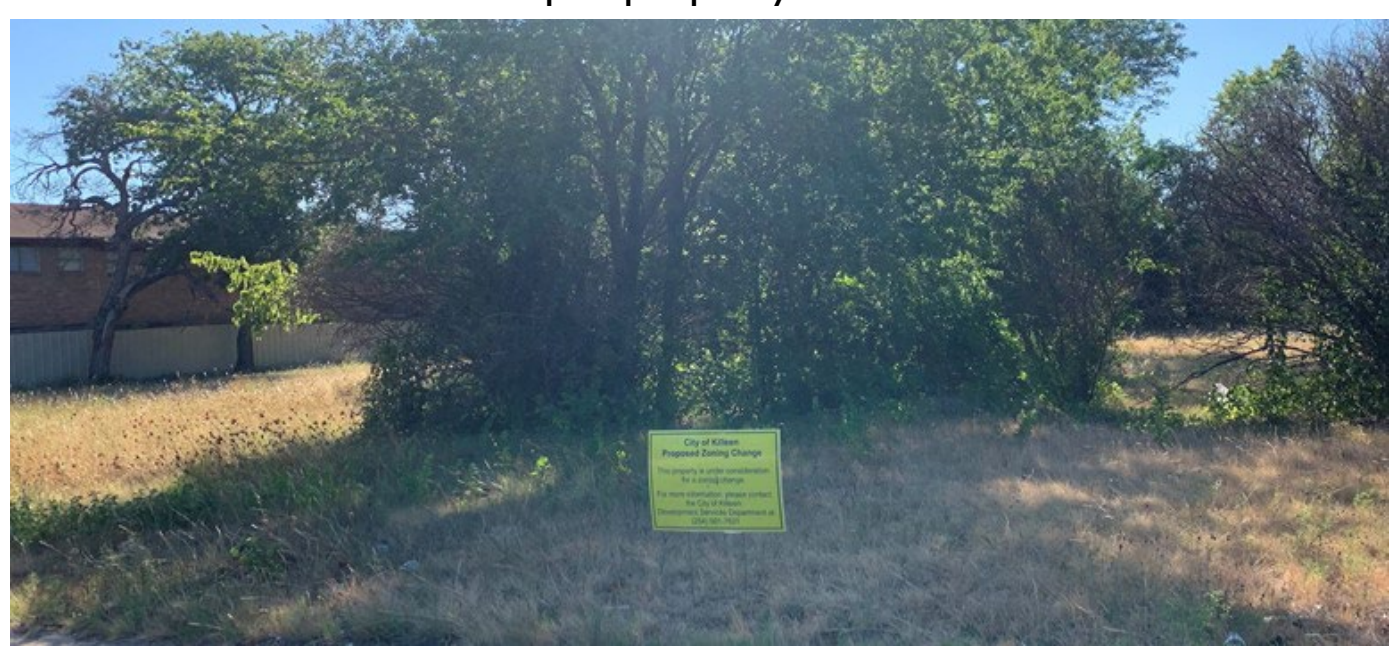
View of the subject property from N. 8<sup>th</sup> Street: