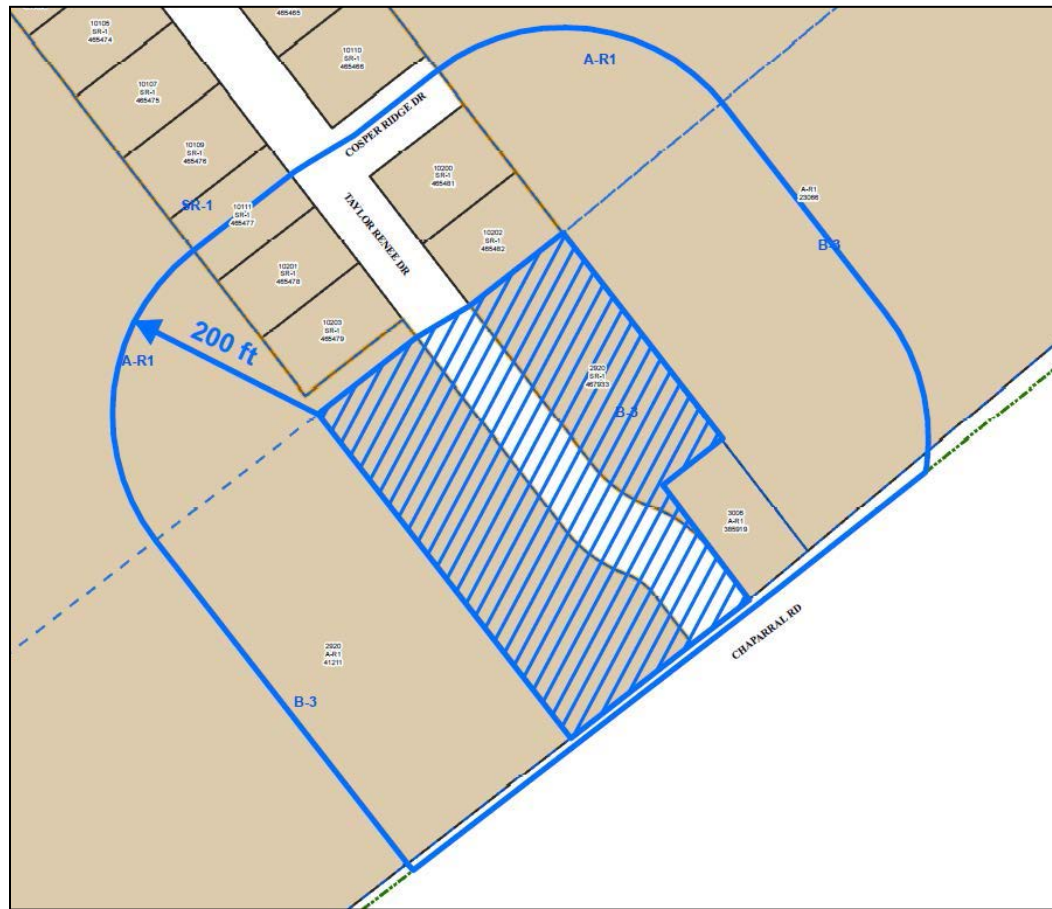
Exhibit 3. Notification Map