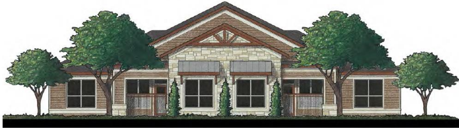
Single Story View

Example Single Story Elevation Four Unit Cottage