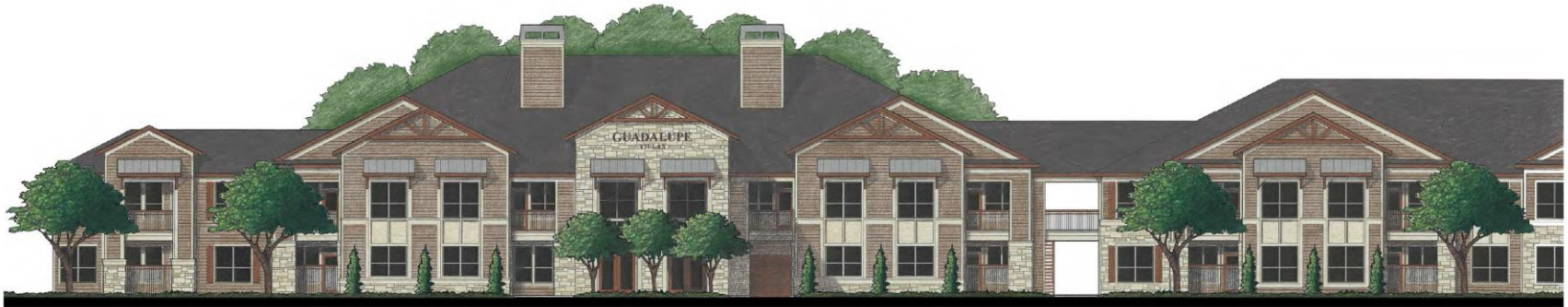
Amenity Center in Two Story Building

Two Story Elevation with Clubhouse and Amenity Center