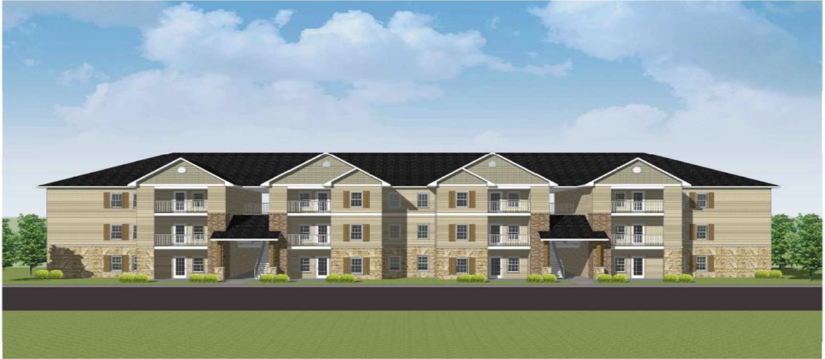
BUILDING FRONT ELEVATION