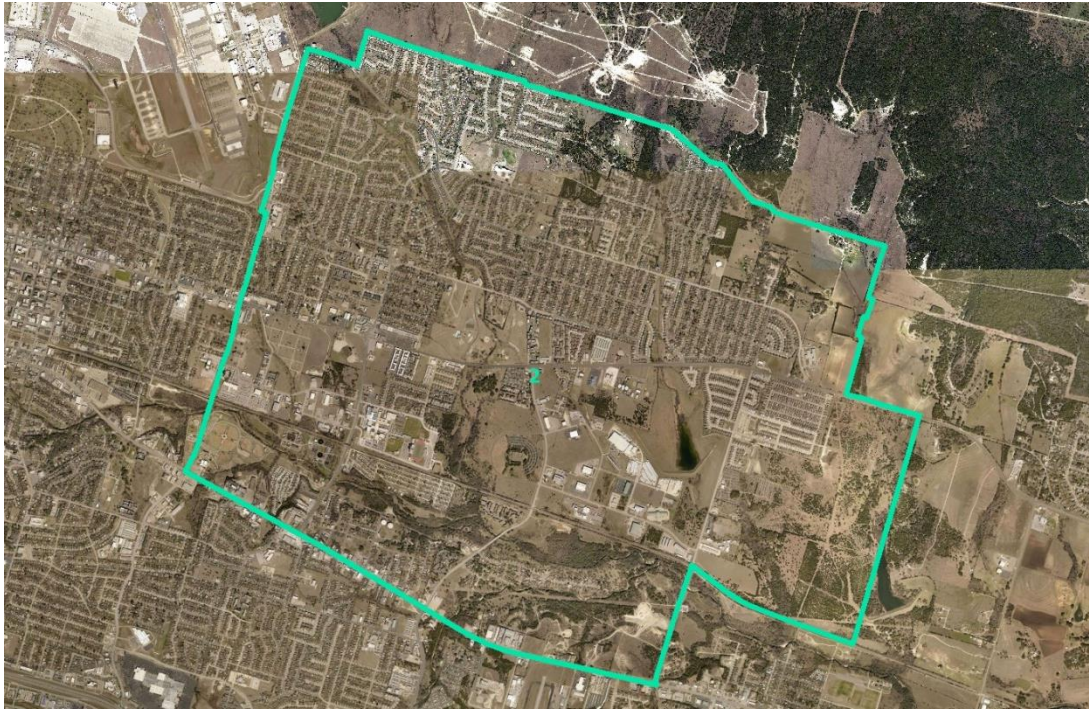
Exhibit A. Killeen Development Zone #2 boundary map.