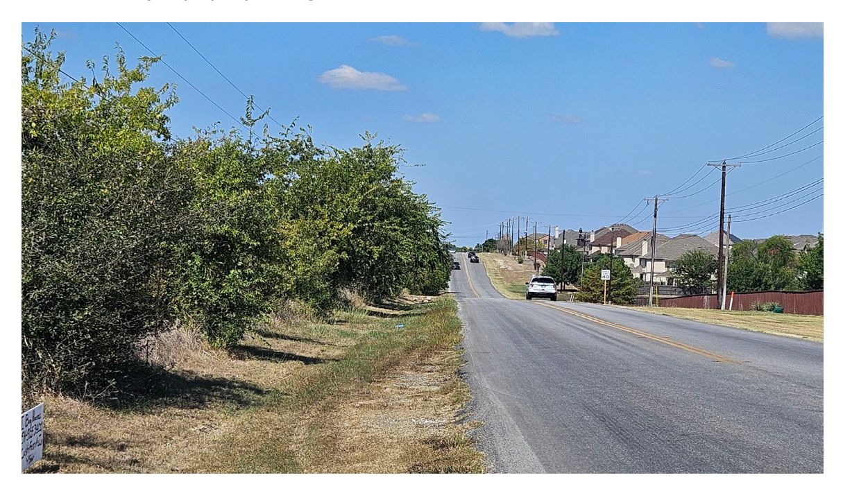
View of the subject property looking south:

View of the subject property looking north: