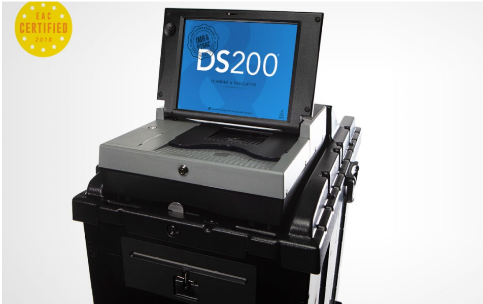
DS200 Precinct Scanner and Tabulator