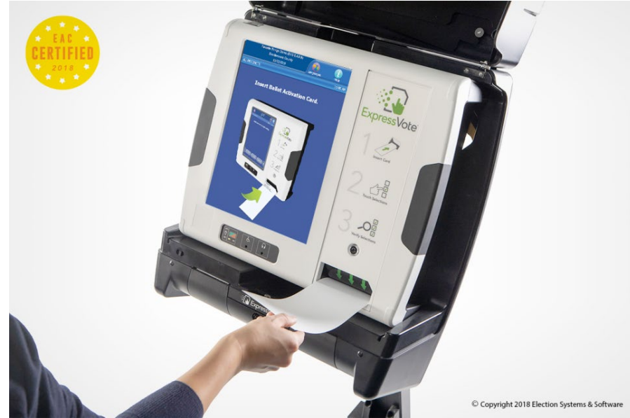
ExpressVote Ballot-Marking Device (ADA)