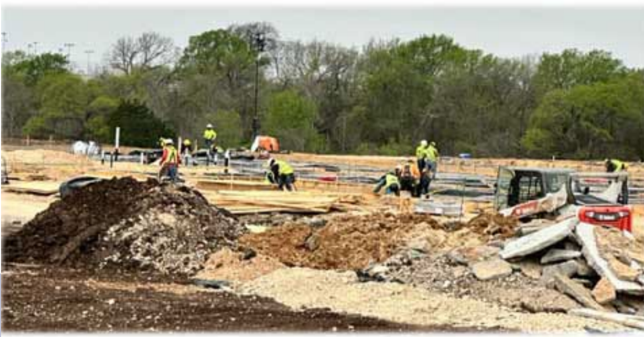
Building Pad Site #1