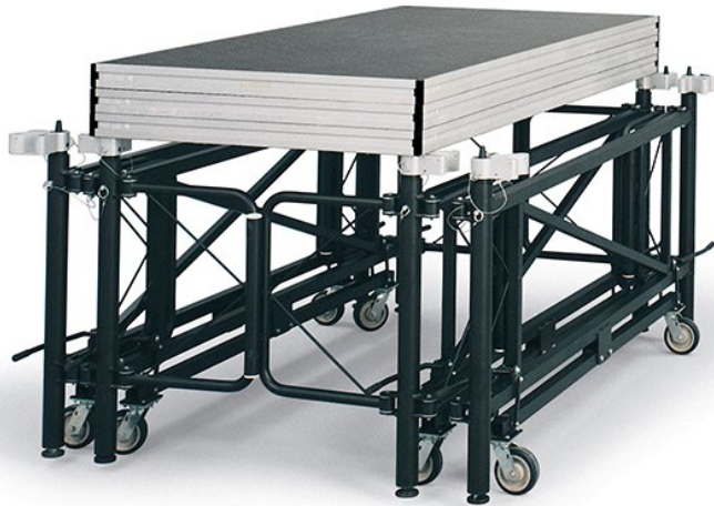
Stage Unit (40, 4x8 ea.)