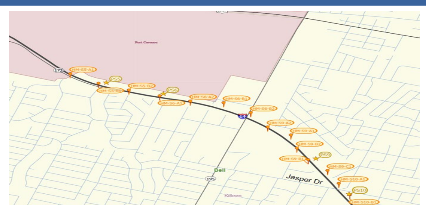
14 High Mast Lights with 4 electrical ports from SS 172 to Jasper Drive