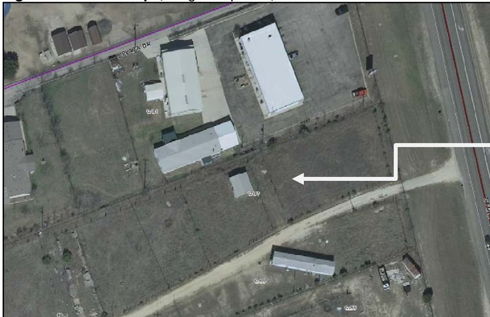
Figure 1. Aerial Map (Google Map data)

KEY: Area requested for future land use amendment