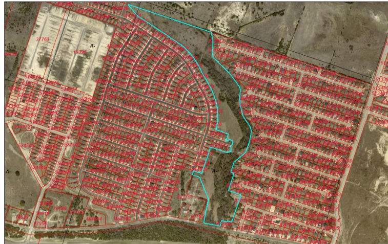
Goodnight Ranch Community Park