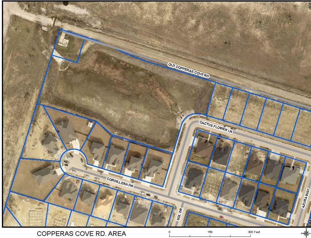
COPPERAS COVE RD. AREA