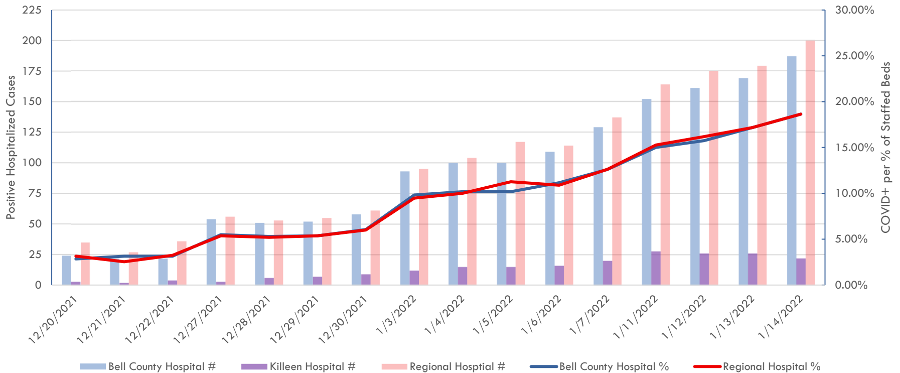
Regional Hospital Data